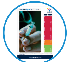
Familiar green, amber & red traffic light system