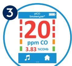
Instant CO readings