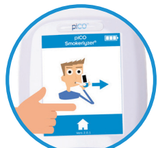
Easy to use touchscreen interface