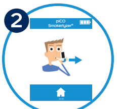
Exhale into the device